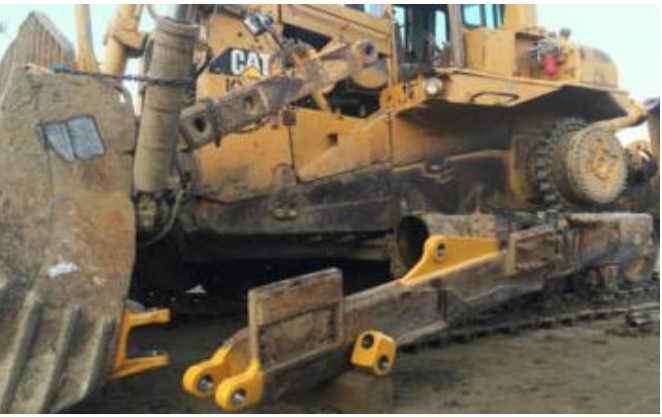
All types and of HDD machines Major overhauling