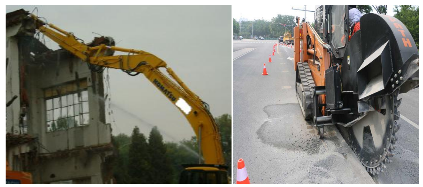
Extra Arm and Slient Cutters