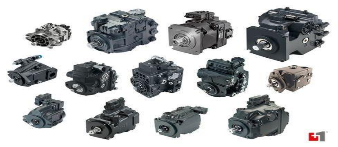
All Type Of Danfoss NEW pump and Motor aILABLE