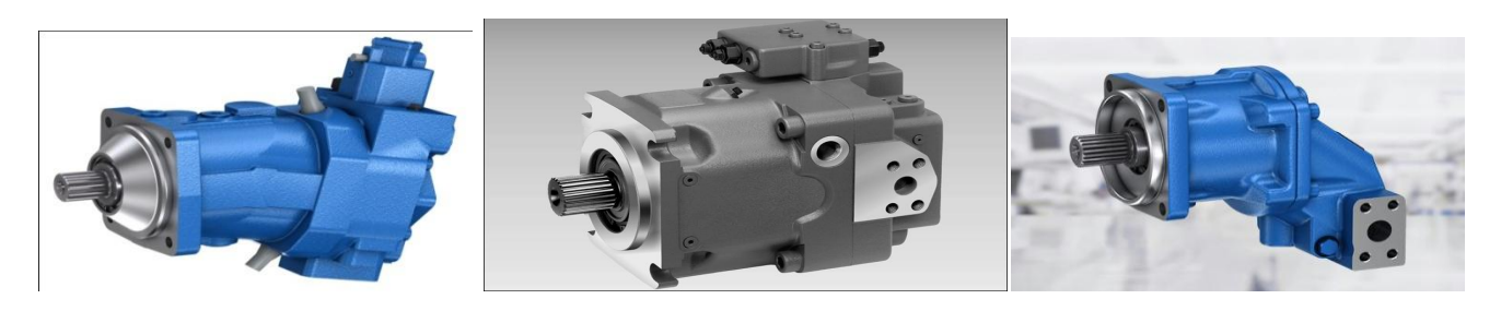
All Types of Rexroth pump and Motors sale