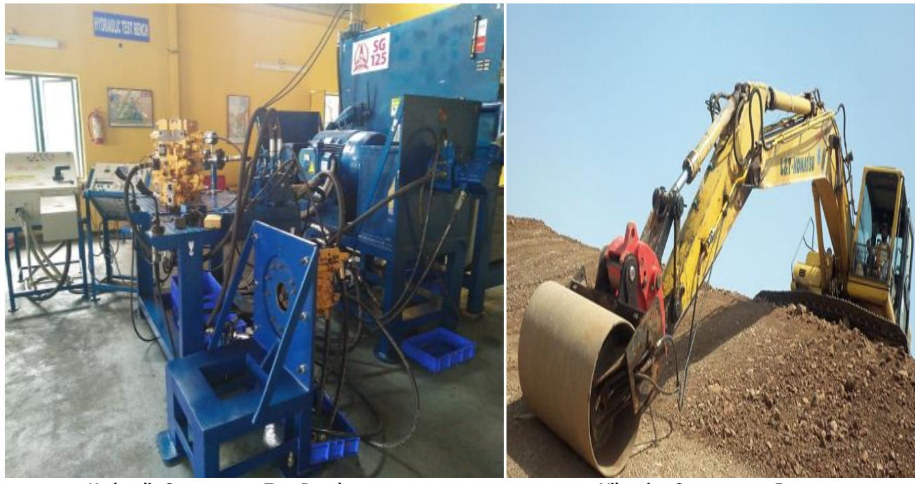
Hydraulic Components Test Bench