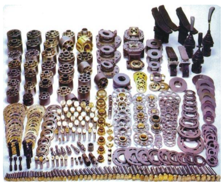
All TYPES HYDRAULIC PUMPS AND MOTORS INNER PARTS