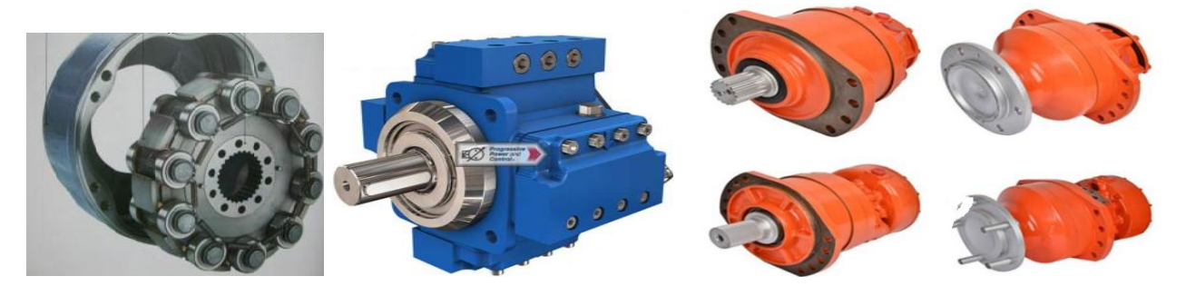
All Types OF Poclain Motors and pumps AVILABLE