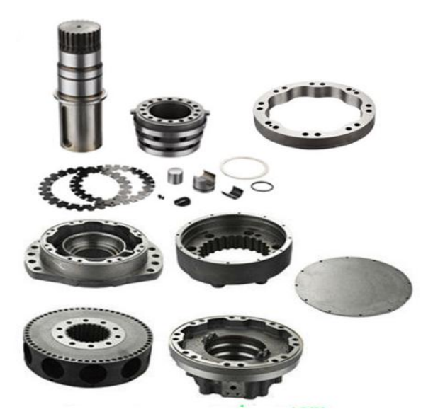
MS05 MS08 MS18 MS83 MOTOR PARTS